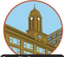
Damon City Campus